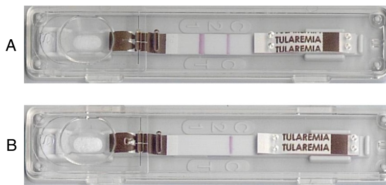
Figure 1 Hand-held immunochromatographic test for the serological diagnosis of tularemia (VIRapid®; Vircell S.L., Santa Fé, Spain). A test is interpreted as positive, if the specific line and the control line are positive (A). The test is valid, but negative, if only the control line is visible (B).

The microarray detecting anti- Francisella antibodies used two different preparations of antigen: Whole-cell bacterial antigen of Francisella tularensis subsp. holarctica strain LVS and commercially available purified LPS were compared. Whole-cell bacterial antigen was obtained after growth for 48 h on Cysteine Heart Agar enriched with chocolate red blood cells at 37°C in ambient atmosphere. Bacterial pellets were harvested and diluted in phosphate-buffered saline containing 5–20 mM sucrose